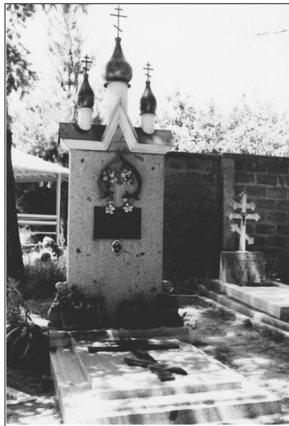
Archbishop Leonty's grave on the Russian Orthodox cemetery near Santiago Chile

1962 — Participated in the establishment of the hierarchy for Greek Old Calendarists in Greece (In spite of the prohibition of the ROCOR Synod of Bishops).