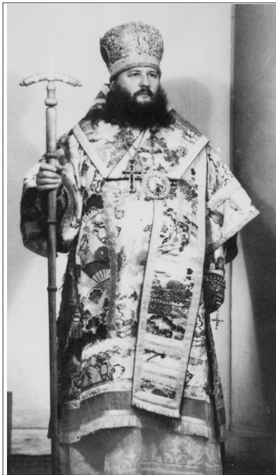
Bishop Leonty in 1942, Ukraine

1941 — Ukraine occupied by Germans. On 18 August of 1941 by the decision of the Bishops of the Ukrainian Autonomous Church (under the Russian Church) Archimandrite Leonty ordained a Bishop of Berdichev.